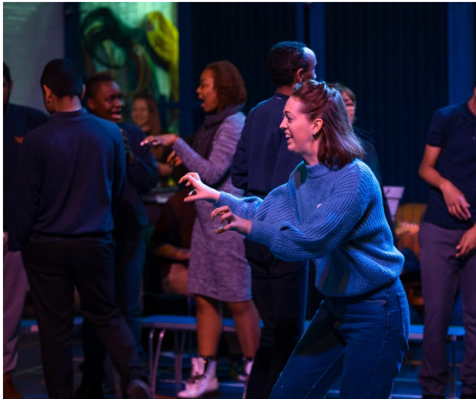
Spitalfields Music & Welsh National Opera

Online TML scheme Q&A session with partner organisations: 12.30-1.30pm, Weds 29 th September 2021 Application Deadline: 9am, Mon 1 st November 2021 Group auditions & interviews: Wed 17 th November (Southampton)